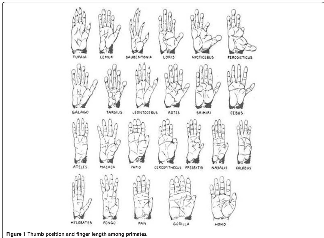
Figure 1 Thumb position and finger length among primates.

There are other differences among species and almost all are related to evolution. Table 1 [57-59] shows some differences in the composition of enzymes that metabolize drugs. Different enzymes metabolize different drugs,