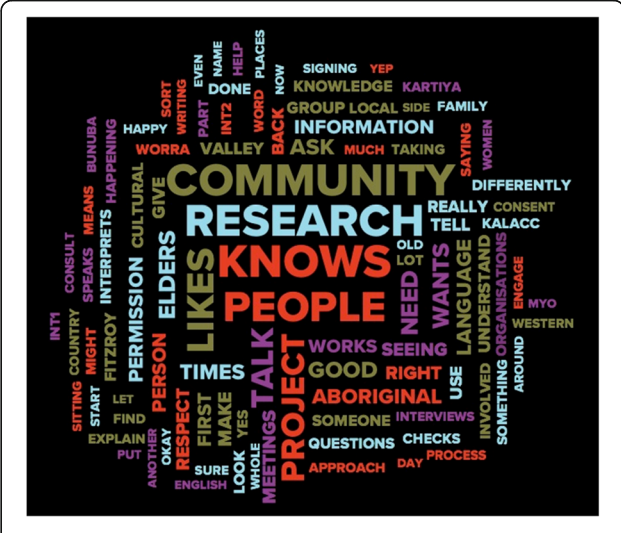
Fig. 2 Word frequency cloud created using NVivo10 qualitative software

In addition, a 'word frequency cloud' was produced using NVivo10 Qualitative Software (Fig. 2). All interview transcripts were scanned for all words and their derivatives greater than two letters to see which were used most often. This produces a word frequency cloud to