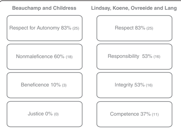
Figure 2 Reported reasons for/against error disclosure categorized according to the principles of Beauchamp and Childress and Lindsay et al. Legend: Percentage and (n) of participants referring to that principle. For disclosure more than one ethical justification was given. Non-disclosure was only mentioned with reference to Nonmaleficience or Responsibility (n = 4).

"I had rather positive experiences (with disclosure)... Contrary to previous fears, disclosure did not lead to a breach of trust, instead I experienced the opposite..." (T7)<sup>b</sup>.