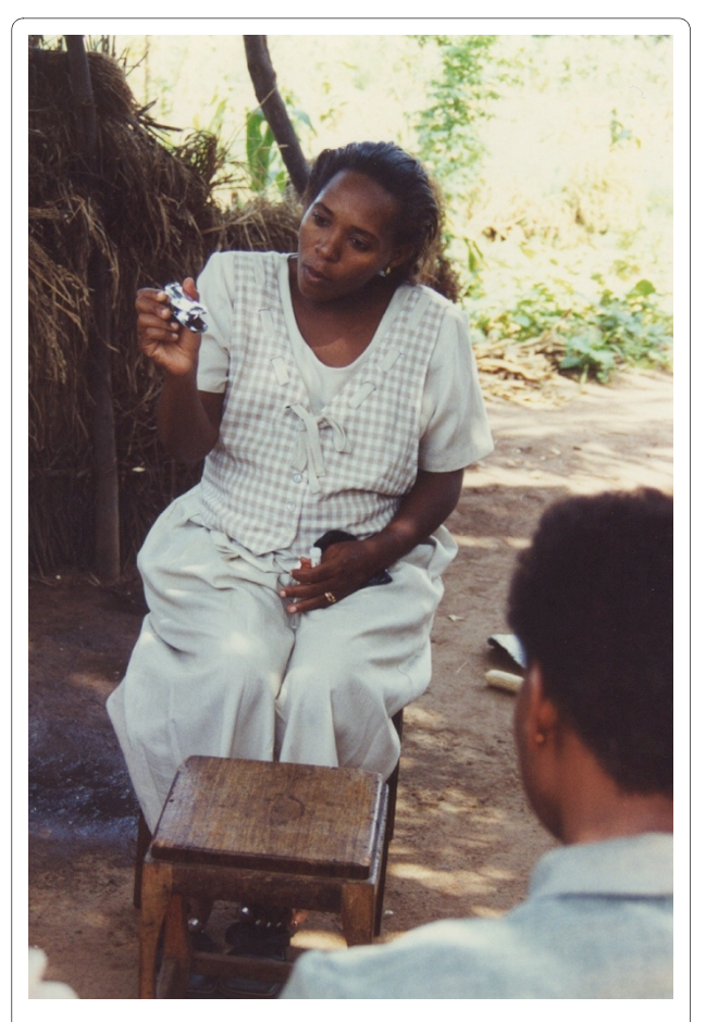
Figure 1 Fieldworker showing a speculum to women attending a facility-based meeting.

The relatively high early losses to follow-up observed during the feasibility study[25], coupled with anecdotal feedback from clinic staff and fieldworkers, and information collected from study participants in community participatory workshops, focus group discussions (FGDs) and in-depth interviews (IDIs) [34], suggested that mis-